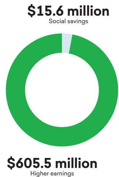
FIGURE 3: Present value of higher earnings and social savings in Massachusetts