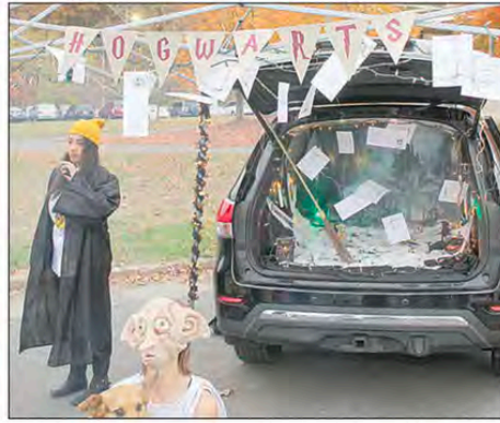
HCC's admissions team re-created the Hogwarts School from the Harry Potter universe. They won two awards, scariest trunk and kids' choice.