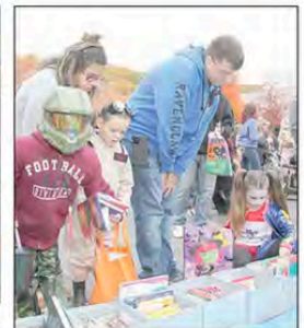
Kids pick through boxes of free books at HCC's trunk-or-treat.