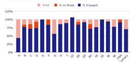
HCC ESOL Students: Initial Remote Engagement -- March 2020