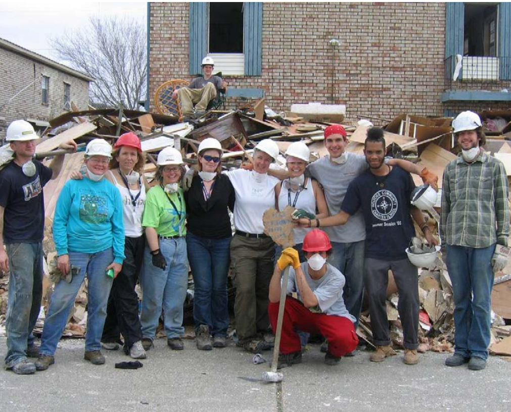
HCC volunteers in front of a building destroyed by Hurricane Katrina. Students and staff spent a week in New Orleans helping residents rebuild.