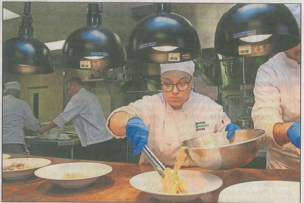
An HCC culinary arts student prepares lunch in one of the kitchens at the HCC MGM Culinary Arts Institute. HCC will open lunches to the public in a new series.